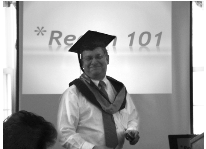
"What me worry!!!!"